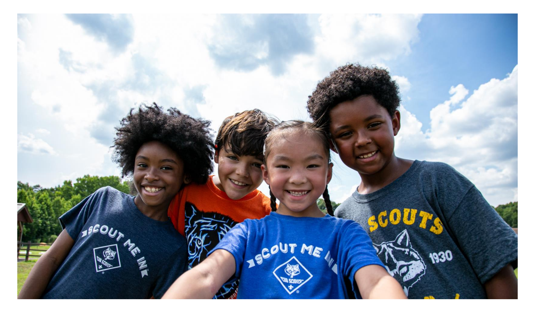
BSA Annual Membership Fee Update June 2023